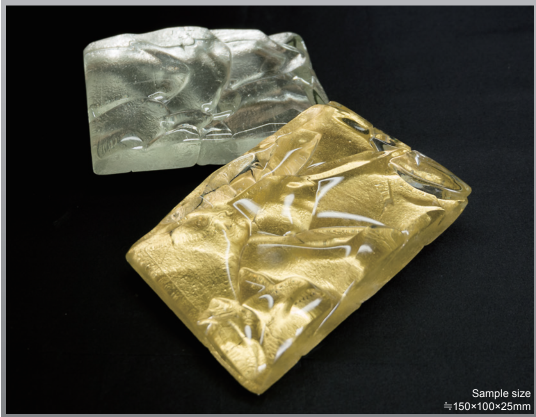
Sample size ≒150×100×25mm

※the color varies with the thickness of glass and PC display.